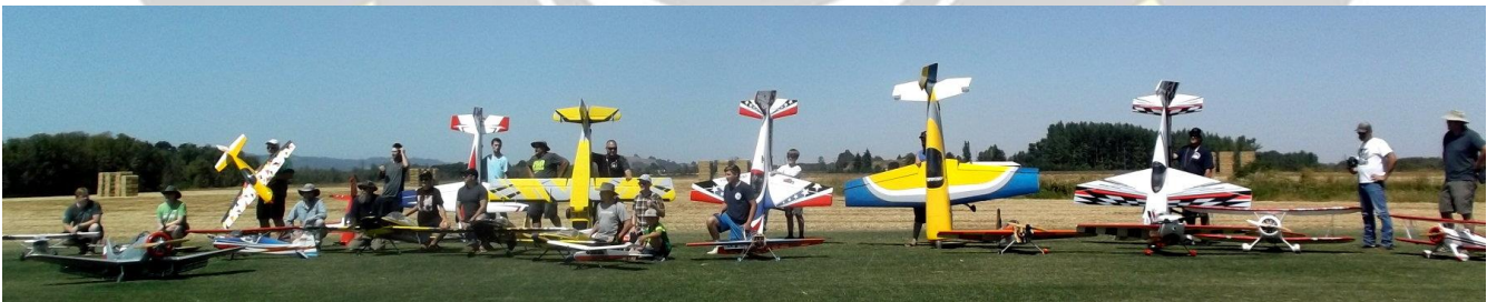
Lots of Monster planes